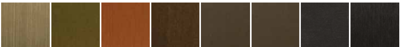
Oyster True Gold Copper Nutmeg Steel Cocoa Slate Noir