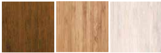
Toffee Bamboo Natural Bamboo Chalk Bamboo