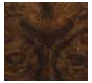
Chocolate Burr Walnut