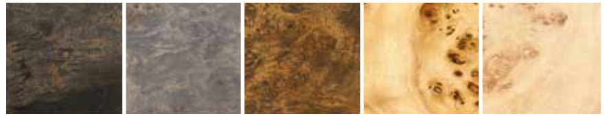
Ebonised Burr Poplar Smoke Burr Poplar Earth Burr Poplar Honeyed Burr Poplar Natural Burr Poplar