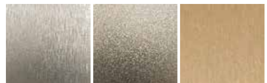
Pewter Silver Sheen Platinum Gold

As an alternative to our wood and engineered wood veneers please select from our range of 11 metallic vinyls for your base option. These metallic vinyls use no chemicals in application and provide the sleek appearance of metal.