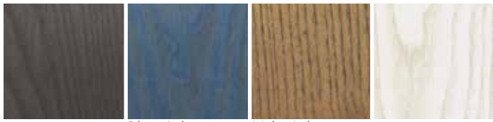
Charcoal Ash Blue Ash Vole Ash White Ash