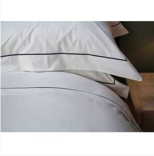
Savile Cord Super King Duvet Cover - Navy