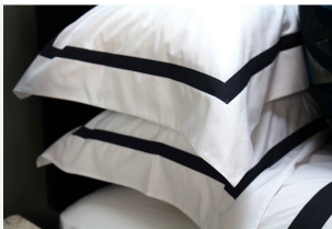
Savile Edge Standard Oxford Pillowcase - Navy