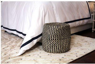
Savile Edge Super King Duvet Cover - Navy