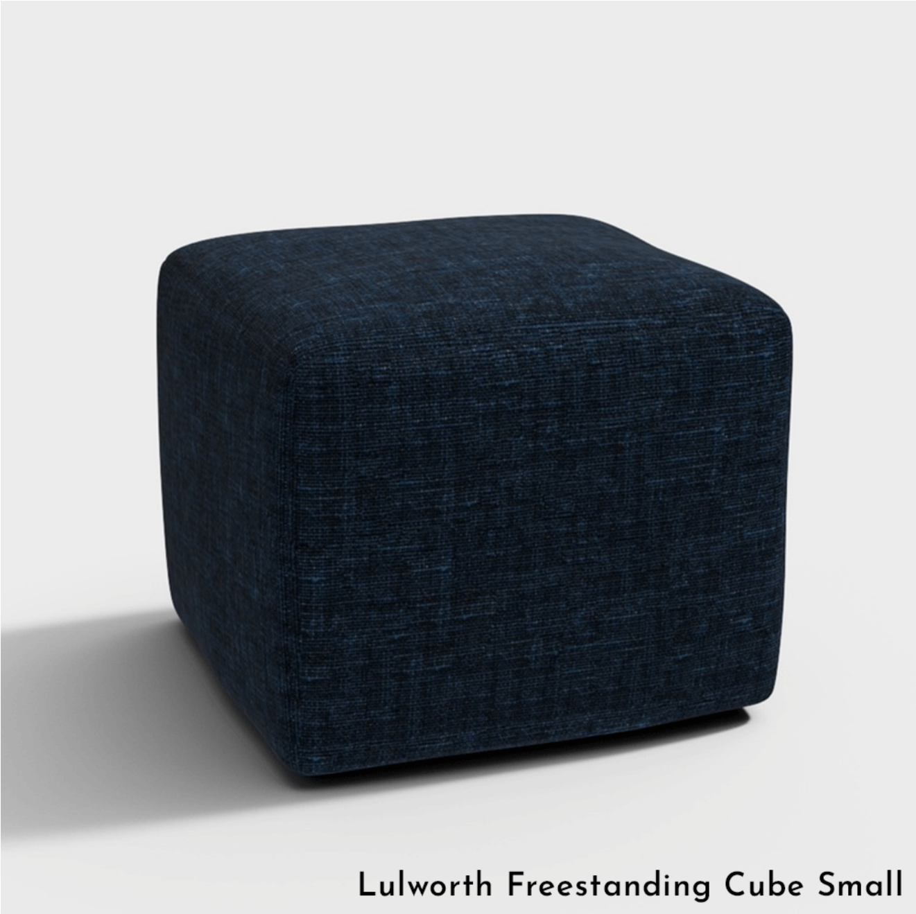
Lulworth Freestanding Cube Small