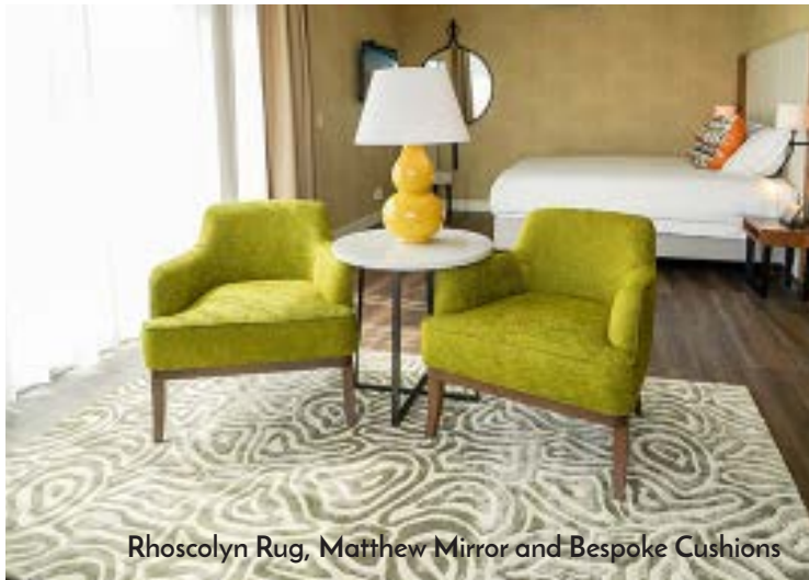
Rhoscolyn Rug, Matthew Mirror and Bespoke Cushions

This charming boutique hotel was dressed using many of our cushion designs, as well as our bespoke cushions, the hotel features many of our soft furnishing and home accessories throughout. Bespoke cushions were created from our William Yeoward fabric as well as our stocked cushions, using designs that echoed the surroundings and character of the hotel.